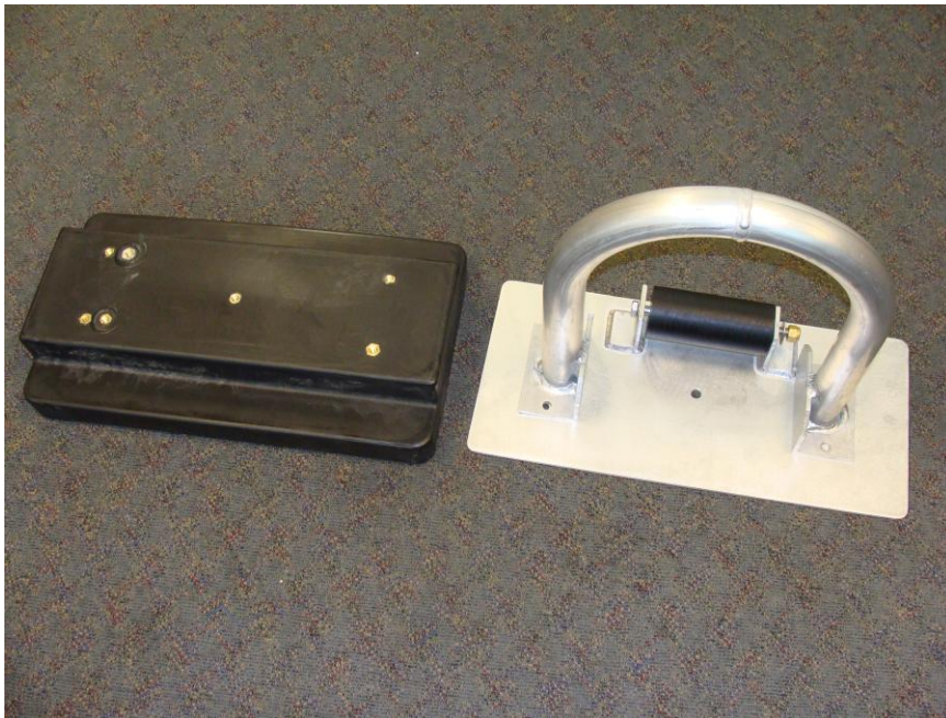
Parts Shown Above: #1, #2, #3